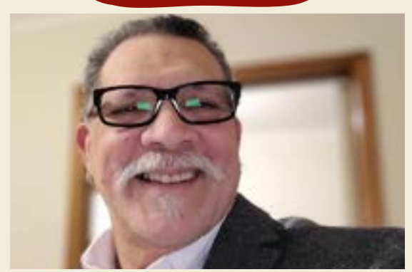
Tell us a bit about who you are

I am a proud Wuthathi man from up in Cape Yorke. We lived in Cairns and then the family moved across the Darwin. I spent majority of my life in Darwin and then in the 1990s I moved down to Melbourne for more job opportunities.