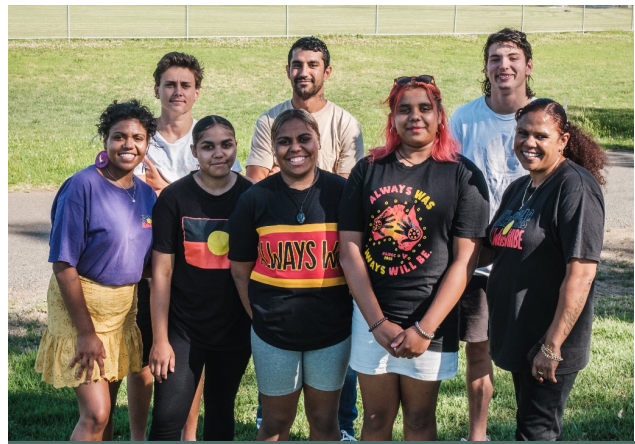
AFL footballer and proud Noongar man Marlion Pickett is ambassador for the program.

New participants will also receive a welcome pack that includes a $15 food voucher.